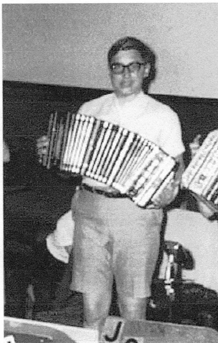
And who is this handsome young man?