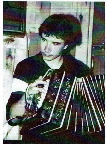
Here's another easy one - who is this?