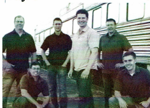
Live Wire band from WI, hopefully will be playing at Murzyn Hall Sunday Sept 20 for the MPA!

Just a few of the bands we should be dancing to this summer at the polka fests!