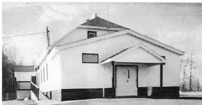
Star Club Hall Celebrates 100 Years 1921-2021